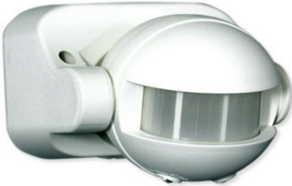
MODEL : HC - 7D

HC-7D sensor switch can detect the infrared Rays released by human body motion within the Detection area, then start the load-light automatically.