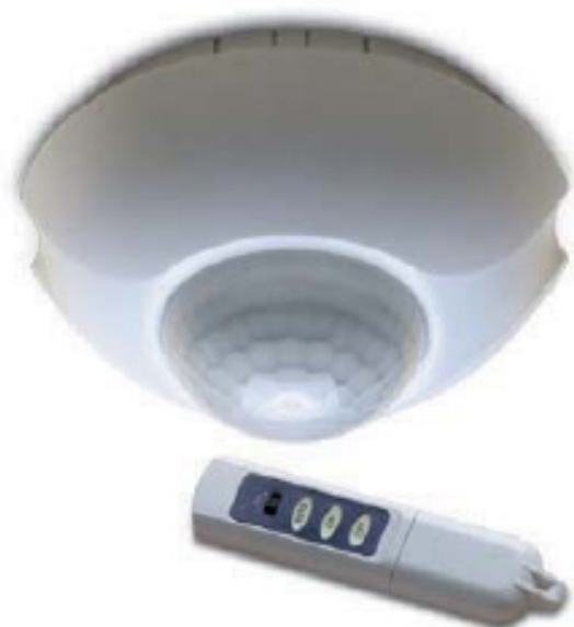
MODEL : HC 26